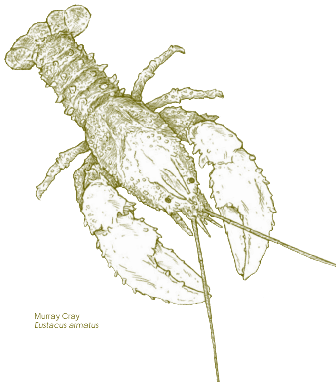
Murray Cray Eustacus armatus

From the peaceful backwaters of the majestic River Murray to mallee wilderness, Riverland parks offer wonderful opportunities for camping, canoeing, fishing and bushwalking.