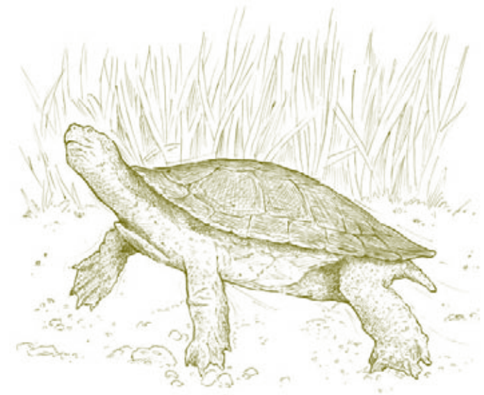
Murray Short-necked Turtle Emydura macquarii

The park provides excellent opportunities for canoeing and birdwatching. There are strong currents in this section of the river. Care must be taken when swimming.